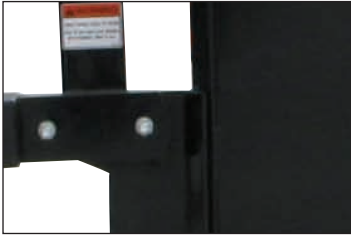
SHEAR BOLT PROTECTION Shear bolt protection with hardened bushing for plow blade