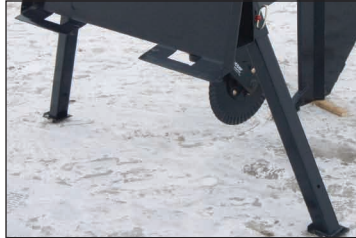
RETRACTABLE LEGS Retractable legs positioned at an angle keep the machine stable when unhooked.