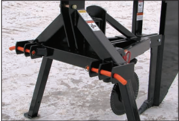
CAT. I AND II HOOKUP PINS Cat. I and II hookup pins for easy 3 point hookup or quick attach skid loader mounting plate for easy mounting.