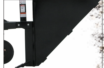
UNIQUE POSITIVE FEED DESIGN of the silt fence plow allows silt fence to be installed in a fast, tight and effective manner. Stainless steel in the key wear areas of the fabric chute ensure low maintenance.