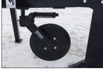
SPRING-LOADED COULTER Standard spring loaded, hardened-steel 16" diameter fluted coulter cuts through tough soil, tree roots and vegetation.