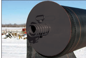
FABRIC TENSION SPRING AND 16" DIAMETER FABRIC PLATES Simple easy to adjust fabric tension spring allows for quick adjustment. 16" Diameter fabric plates prevent the fabric from telescoping over the plates during installation.