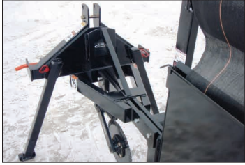
TUBE STEEL A-FRAME DESIGN Tube Steel A-frame design with 1" stringers