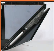
FC-1136 36" FABRIC CURTAIN The fabric curtain is a plastic divider that separates the fabric so it does not rub against itself when going through the fabric chute. It is only needed when using non-woven fabrics to prevent the fabric from grabbing itself and pulling down. With slick woven fabric, the divider is not needed.