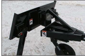
FRONT PIVOT Simple front pivot allows for tight turns.