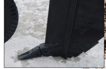
KNIFE POINT Replaceable hardened-steel knife point is designed to disrupt the soil upward for easier pulling and proper silt fence installation.